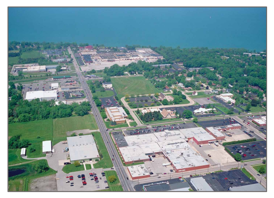
LECO World Headquarters—St. Joseph, MI

With dedicated support after the sale including highly trained service support personnel, customer training courses, SmartLine<sup>®</sup> Remote Diagnostics, preventive maintenance agreements, and a full line of consumables and spare parts, LECO stands by our commitment of helping you achieve the right results.